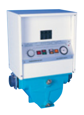
36PHR 30kW - 36kW