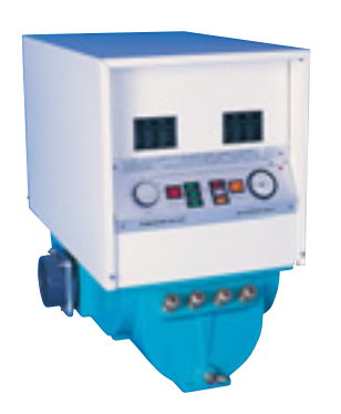
120PHR 84KW - 120KW