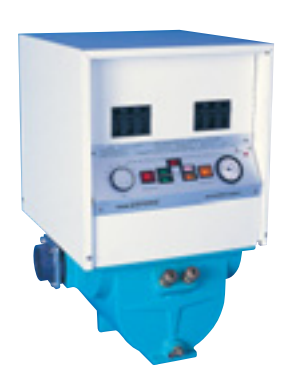
72PHR 48kW - 72kW