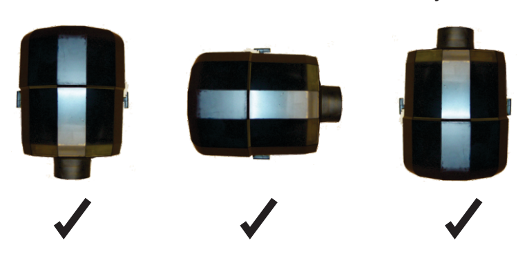
Installation Orientation Options

Installation Environment: Indoor Use Only