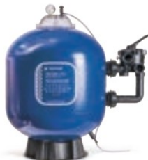
TRITON® NEO SM