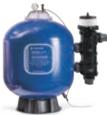
TRITON® NEO PROVALVE