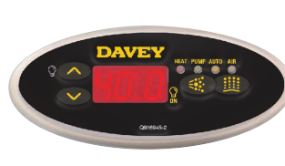
LED Oval Touchpad