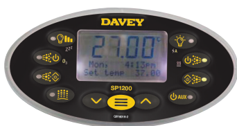
LCD Oval Touchpad