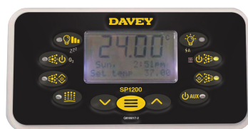
LCD Rectangle Touchpad