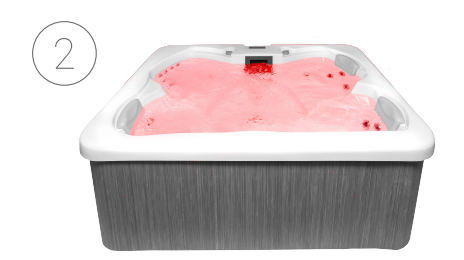
Heating only mode Heats the spa water.