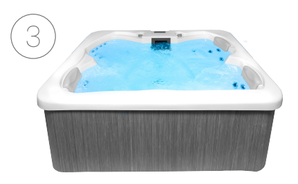
Cooling only mode Cools the spa water.