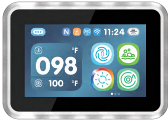
PB565 control panel design

5.0 inch TFT color display screen, touch screen